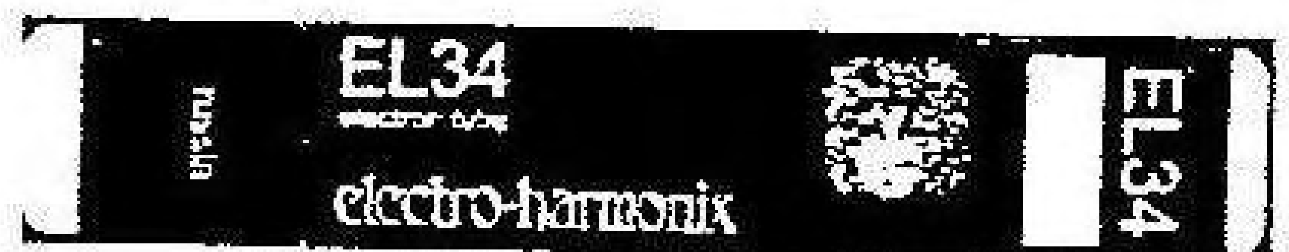
Fig. 1B. Electro-Harmonix carton, including end flaps.