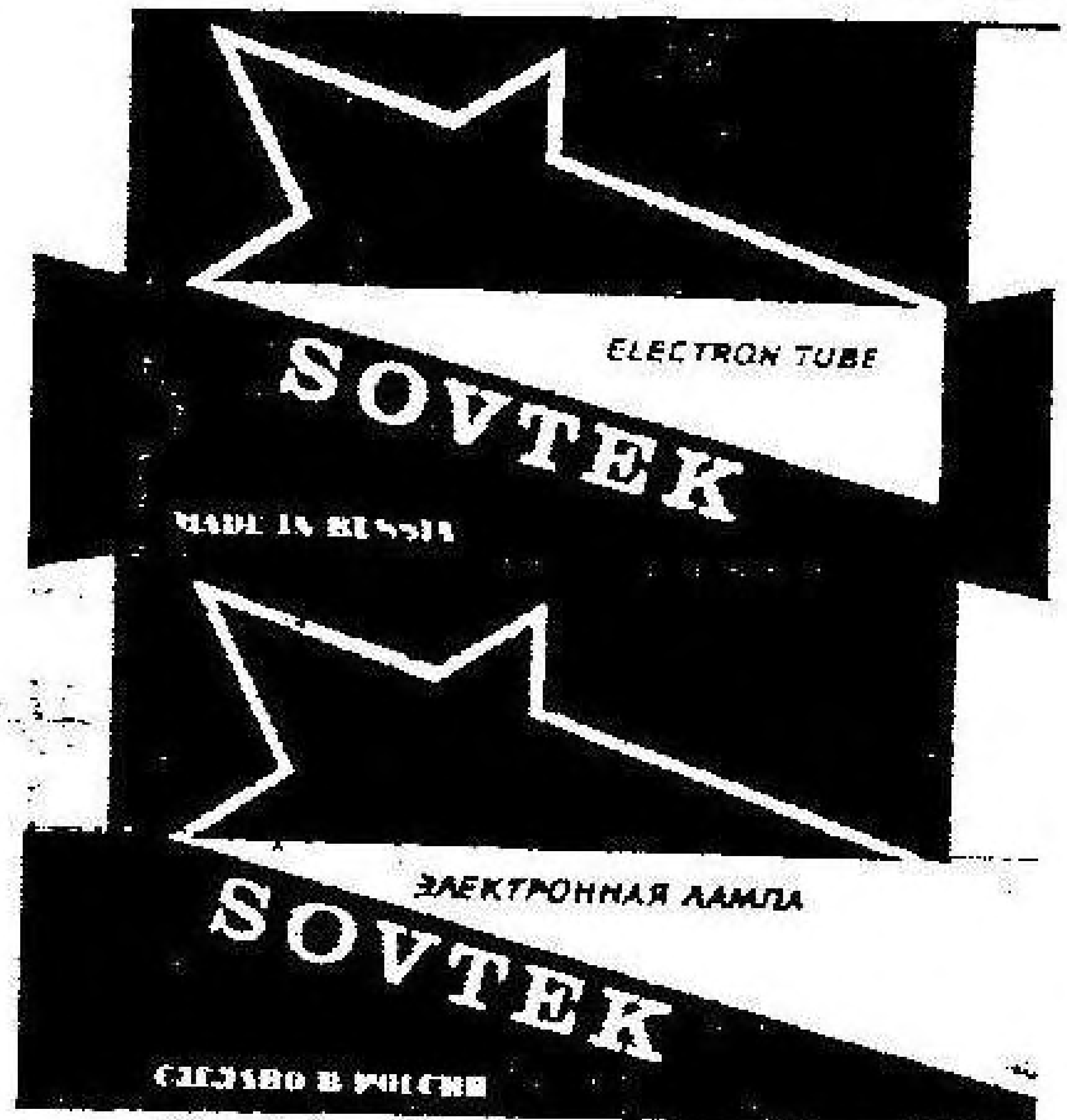
Fig. 1A. Sovtek red-blue-black carton, showing all four sides.

With the Soviet tubes on sale, the customers began to see that the quality of these tubes was not bad - on the contrary, very good - for which the tubes were accepted in a short time.